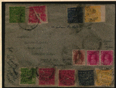
1940 All four values including a dramatic printing fold on cover to Canada.

"The most valuable item in Nepal philately." To be auctioned June 27th, 2012.