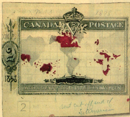
Figure 1. Warren L. Greene's preliminary sketch of the 1898 Imperial Penny Postage map stamp sold for $4,000 Canadian at auction last October.