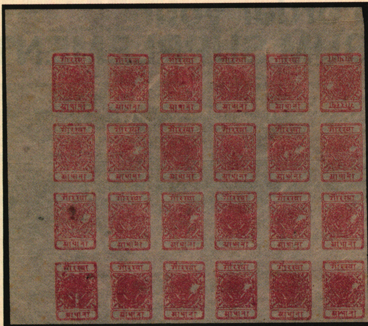
Scott #11, 11a block of 24, one inverted.

"The most valuable item in Nepal philately." To be auctioned June 27th, 2012.