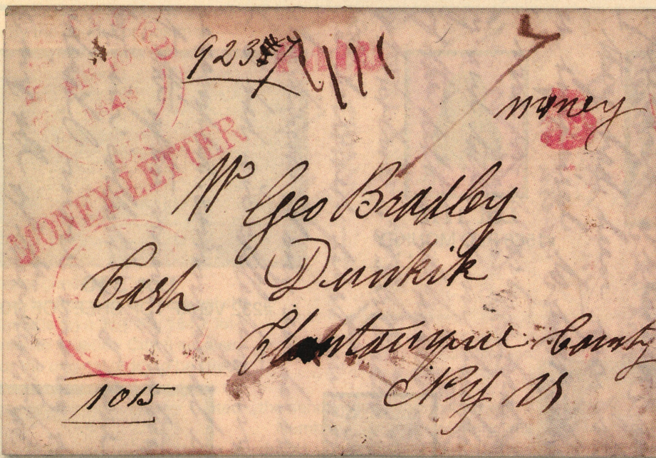
Figure 1. A money letter sent from Canada to the United States on May 10, 1848. Once across the border, such letters became vulnerable, as there was no equivalent secure U.S. mailing system.

The first use of the phrase money letter on Canadian mail is found on a letter from 1825.