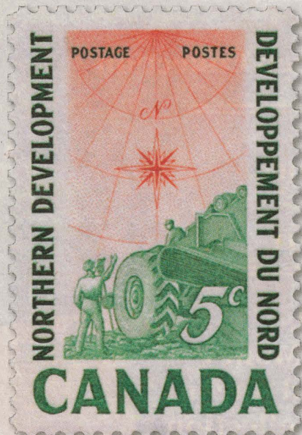
Figure 1. This Canadian 1961 5¢ Compass Rose, Earth Mover and Surveyor stamp (Scott 391) was issued to commemorate development of Canada's Northland.

The 1961 5¢ Compass Rose, Earth Mover and Surveyor stamp was designed by a warrant officer from the Royal Canadian Engineers.