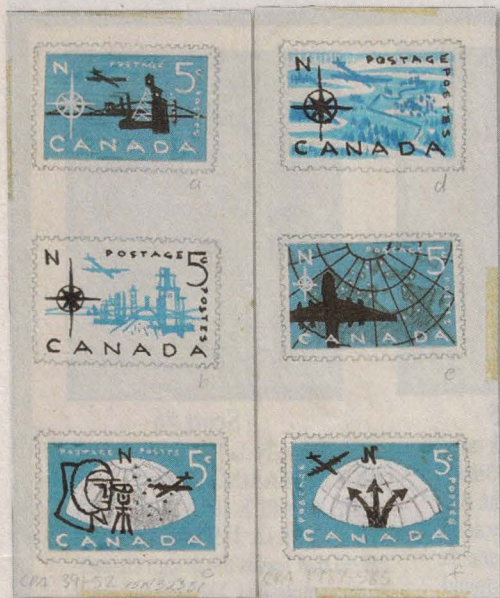
Figure 3. Six essays in watercolor for the issue by an artist whose name is presently unknown.

The C design in the lower left corner was