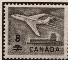
Figure 6. It has been 39 years since Canada's last overprinted stamp. The 8¢ on 7¢ blue Jet at Ottawa Airport stamp, Scott 430, was issued in 1964.

In case you were wondering, it has been 39 years since Canada last issued an overprinted stamp. That provisional stamp, Scott 430 (Figure 6), was created in 1964 when Canada's airmail rate increased from 7¢ to 8¢. Two scarce vari-