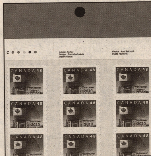
Figure 4. A constant red-dot variety is found in the right margin on one stamp in every second booklet of 30 stamps.

Post offices around the world create material for their operating needs that is not philatelic but which, because