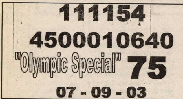
Figure 5. The packing slip accompanying the overprinted stamp booklets includes code numbers (which are explained in the article), packaging and printing information.

The "Vancouver 2010" overprinted booklets of 30 are shrink-wrapped in packages of 25 booklets of 30. Each package has a packing slip. The six-digit number (111154) on line 1 of the slip is the product number. The product number for the