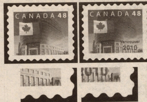
Figure 3. Die-cut differences between the original definitive issue at left and the overprinted definitive at right are explained in the text.

LICHTMAN COMPANY 527 W. 7th Street, Suite 303, Los Angeles, CA 90014