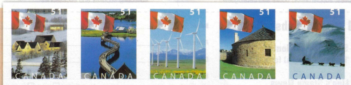
Figure 2. The Canadian flag flies over five scenes from across Canada. The self-adhesive stamps are sold in booklets of 10.

The list of commemoratives for 2006 starts with two stamps debuting January 29 — the first day of the Year of the Dog — for the 10th release in the Lunar New Year series. As usual, there will be a domestic rate stamp in sheets of 25