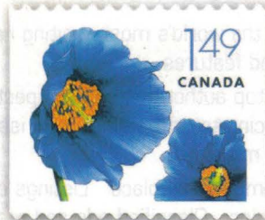
Figure 1. Four new Flower definitives were issued in December to meet new postal rates going into effect in January 2006.

T hemes of history, nature and art will feature on many of the postage stamps from Canada Post for 2006. The 80th birthday of Queen Elizabeth II will be celebrated on one of the year's first stamp issues, while Canada Post will mark its own silver anniversary near the end of the year with a new commemorative envelope.