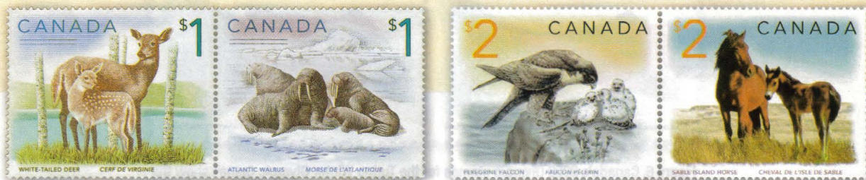
Figure 3. Two new $1 stamps showing the Atlantic walrus and the white-tailed deer were issued October 20. Two new $2 stamps showing the peregrine falcon and Sable Island horse were issued December 19.

and a souvenir sheet of one stamp at the international rate (Figure 5).