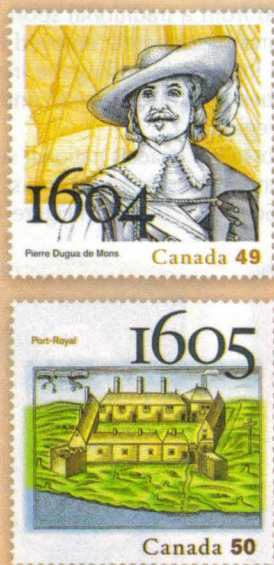
Figure 8. The series commemorating French explorations and settlements began in 2004 and continued in 2005. The third stamp in the series will commemorate Samuel de Champlain in a joint issue with the United States.

Stamp Month in October will begin a series on endangered species. The first issue will consist of four stamps featuring the swift fox, blue racer