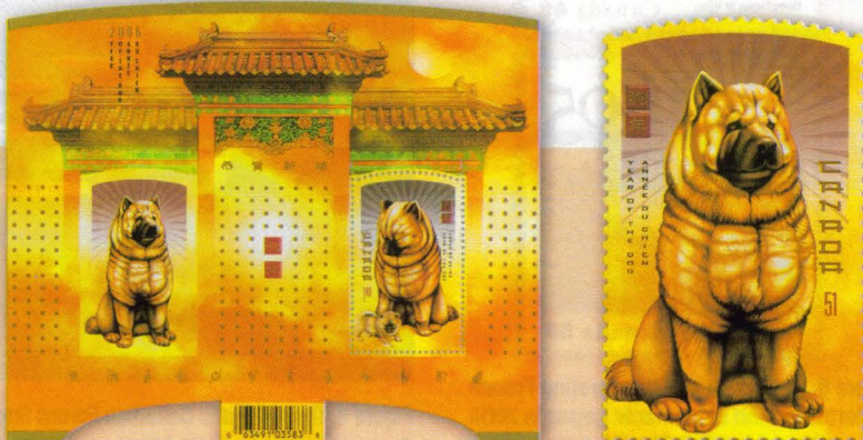
Figure 5. The 2006 Year of the Dog Lunar New Year 51¢ stamp and $1.49 souvenir sheet.