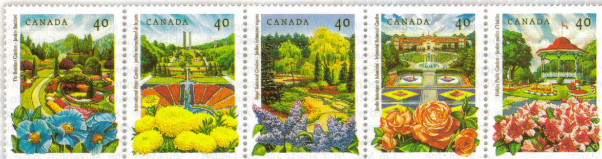
Figure 7. These five stamps showing public gardens were issued in 1991. A new set expected in March will highlight different types of gardens.

In July, a single domestic-rate stamp will be issued for mountaineering, on the occasion of the 100th anniversary of the first meeting of the Alpine Club of Canada in Winnipeg. The club is now headquartered at the Canmore Summer Mountaineering Camps.