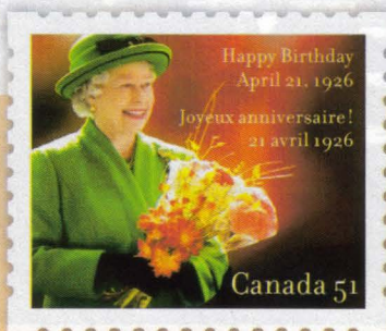
Figure 4. The Queen Elizabeth 80th birthday commemorative-definitive will be available throughout 2006.

Lacrosse is Canada's national summer game and was last honored on a stamp in 1968 (Scott 483, shown in Figure 10).