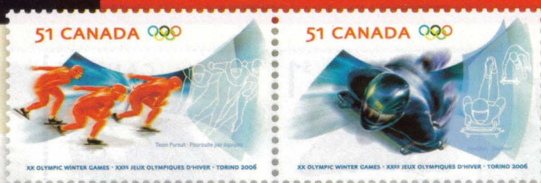
Figure 6. Canada's 2006 Olympic stamps for the Torino Winter Olympic Games show the sports of skeleton sled racing and speed skating.