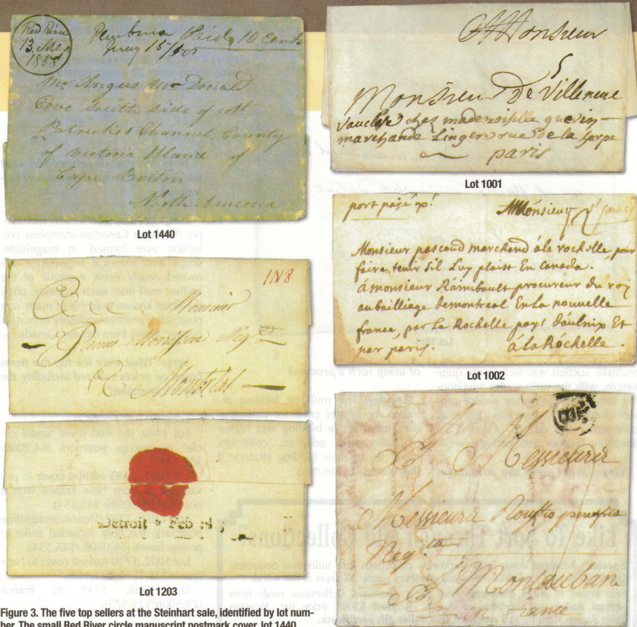
Figure 3. The five top sellers at the Steinhart sale, identified by lot number. The small Red River circle manuscript postmark cover, lot 1440, sold for more than $52,000.

tions for Steinhart's most famous collection for a sale titled, "Prestamp and Stampless Covers to, from and through British North America, 1685-1865."