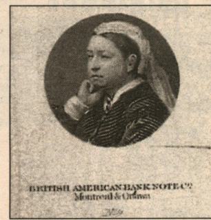
Figure 4: Vignette for the 1893 Widow Weeds stamps.

Jones' Widow Weeds engraving, prepared in 1867, was extremely popular. It was adapted for use on Canadian revenue stamps (the Third Bill issue of 1868-82); advertising leaflets (Figure 2: from The Postage Stamps and Postal History of Canada by Winthrop S. Boggs); cachets on commercial envelopes