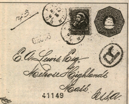
Figure 8: A commercial single franking... or is it?