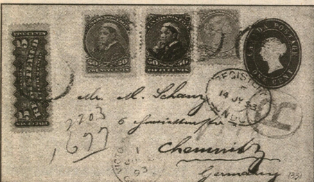
Figure 7: A philatelically inspired cover to Germany.

Figure 8 is closest to being a single franking. Posted at Fredericton, New Brunswick on Nov. 10, 1902, to Melrose Highlands, Mass., the 20-cent single franking overpays or underpays by one cent the registered letter rate to the United States. It is made up of the five-cent registration fee with either the remaining 15 cents overpaying the up to seven ounce rate (14 cents) or underpaying the up to eight ounce rate (16 cents). The British Guiana postal stationery envelope has been discounted.