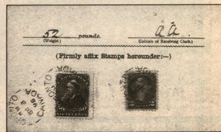
Figure 6: A bulk newspaper receipt.