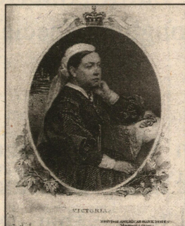
Figure 1: Original engraving by Alfred Jones used for the 1868-82 Bill stamps and adapted for the 1893 Widow Weeds.

These were the highest denominations stamps issued in Canada since the 17 cent of 1859 and the 15 cent of 1868. They are considered part of the Small Queen series of Canadian stamps by most collectors and cataloguers, in part because the stamps were released during the lifetime of the series with the last Small Queen, the 8 cent issued to pay the combined registered letter rate (3 cents per ounce and 5 cents registration fee), being released on Aug. 1, 1893.