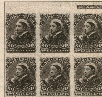
Figure 5: Blocks of the imperforate Widow Weeds.