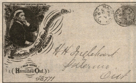
Figure 3: The Jones engraving sold to the Victoria Mutual Fire Insurance Co. of Canada by the BABN and used by them as a cachet on their solicitation envelopes.

The design of the Widow Weeds is based on an engraving by Alfred Jones (1819-1900) (Figure 1, all illustrations accompanying this article are courtesy The Brigham Collection unless otherwise noted). Jones