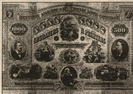
Figure 2: British American Bank Note Co. advertising leaflet that includes the Alfred Jones engraving of Queen Victoria at bottom center.

Others, however, regard these stamps as a separate issue. They feel that the values are different enough to be counted out of the Small Queen series. They do not show the same portrait of Queen Victoria and, at 20 x 26mm, they are much larger in size.