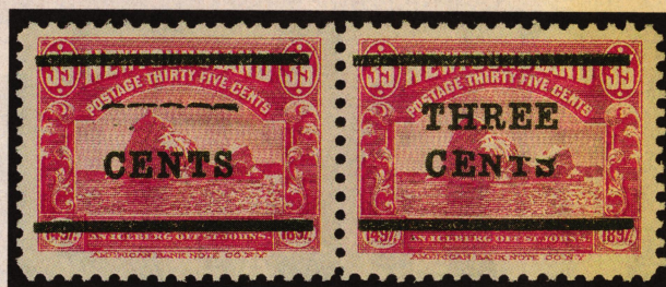
Figure 8. Despite being known as the "THREE-omitted" variety, the "THREE" is never completely absent on this surcharge variant.

The 3¢-on-15¢ (Type I) is known with an inverted surcharge (Scott 128a, at bottom in Figure 6) as is the 3¢-on-35¢ (130b). The existence of the latter va-