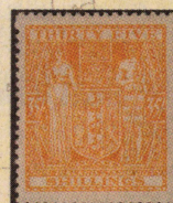
NZ 35/- Arms MUH

Featuring superb Full Face Queens including a unique 2d blue stitch wmk SG 96 variety; scarce 1906 1d claret Christchurch Exhibition, good range of NZ Arms including 25/- inverted wmk mint, & 35/- MUH; rare NZ Revenues incl EVII 26/6d Beer Duty; Pigeon Post flimsies; Robin Startup's military postal history; good Antarctic material from Shackleton & Byrd Expeditions; GB 1d Blacks; useful China & hundreds of world wide collections - estimated NZ$250-$10,000.