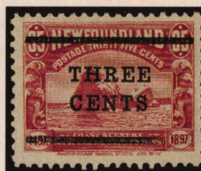
Figure 4. The 6¢ Logging stamp of the Cabot series was the only 6¢ available for franking foreign mail, so Cabot high values were surcharged, such as the 35¢ red Iceberg Off St. John's stamp.

The first trial surcharge, in a setting of 25 units (five by five), read "THREE CENTS" in two lines of Roman capitals between two long horizontal bars. The