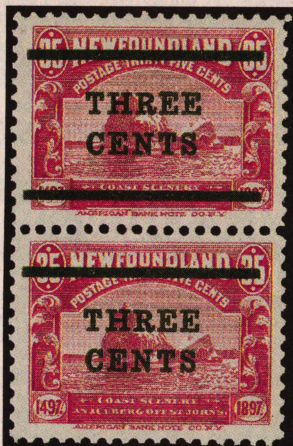
Figure 7. The known varieties of the 1920 surcharges include the lower bar of the overprint completely or partially missing.

Varieties exist for all surcharges. Fifty copies of the 2¢-on-30¢ are recorded with an inverted surcharge (Scott 127a, pictured at top in Figure 6). This stamp