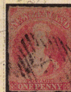
NZ 1859 SG 27 rouletted, no wmk