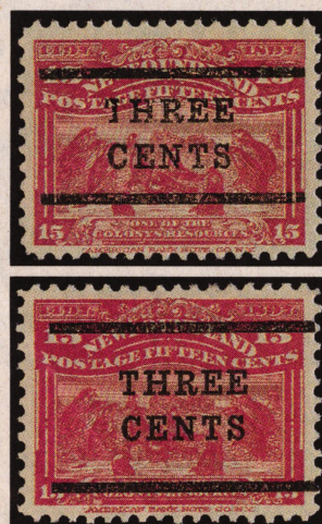
Figure 3. At top, the Type I overprint of the 3¢-on-15¢ issue of 1920 (Scott 128). On the Type II variety at bottom (129), the lower bar is farther from the top bar to better obliterate the lower value inscribed on the stamp.

Letters from other towns and the outports (small,