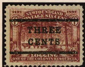
Figure 2. With the last 3¢ stamps depleted, high values of the 1897 Cabot series were revalued to 3¢ with a surcharge. This example overprinted 3¢-on-6¢ in black is considered an essay.