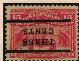
Figure 6. Varieties exist for all the 1920 surcharges. Only 50 examples are recorded of the inverted 2¢ on 30¢ (top). The 3¢-on-15¢ also exists with inverted surcharge (bottom).