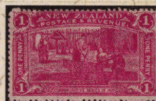
NZ 1906 1d claret mint