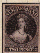
NZ 1855 Die Proof

WEST PLAZA HOTEL, WELLINGTON, NEW ZEALAND