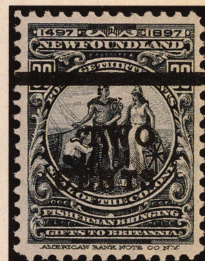
Figure 5. Paying the local letter rate and fiscal usages, 2¢ stamps were urgently needed. The 30¢ Colony Seal issue became a 2¢ stamp after surcharging.

black surcharge was applied to 500 sheets (50,000 stamps) of the 35¢ Iceberg Off St. John's stamp (Scott 73) from the Cabot series, and the stamps were issued Sept. 14 (130, Figure 4).