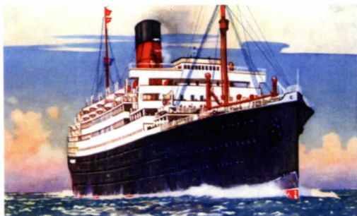
Figure 7. RMS "Samaria"