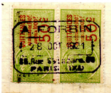
Figure 8. A. Forbin's personal cancel used on 1921 document regarding theft of stamps from him

Among the archive is a most interesting document which is now in my stamp collection. It is an agreement dated October 21, 1921, between Forbin and René Lagaire, a worker who it seems, had stolen from him and had been caught red-handed. René Lagaire acknowledged that while he was working as a handyman in Forbin's house and shop at 80 rue de St-Lazare, he had on many occasions stolen stamps and other valuables. As a compensation and to avoid being prosecuted he confessed in writing and agreed to pay Forbin 2,400 francs immediately, plus 600 francs on May 1, 1922, and 1,000 francs on December 1, 1922. The third page of the agreement bears a pair of 50 francs quittance (receipt) fiscal stamps duly cancelled with Forbin's handstamp on October 28, 1921 (Figure 8).