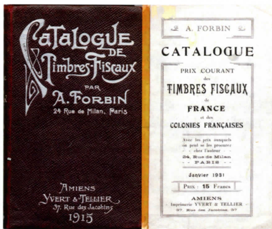
Figure 3. Forbin 1915 world revenue catalog