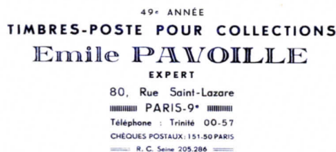
Figure 5. Emile Pavoille letterhead circa 1950

He sold his postage stamp holdings to Émile Pavoille sometime between 1921 and 1924, but he was to remain active in the wholesale and auction philatelic market. Émile Pavoille was a renowned stamp dealer and he signed many stamps of France and colonies, Hungary and Belgium as an expert. He kept doing business in the stamp market at Forbin’s address, 80 rue de Saint-Lazare, under the name “Maison Émile Pavoille” (Figure 5). Already