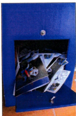
The Lundy Postbox

Summarising, Lundy held a place of honour at Stockholmia 2019, a well-deserved honour for our 90-year old Lady!