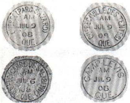
1. Proof Book Specimens

The celebration lasted from the 19th to the 30th of July. During this time the Post Office Department put into operation four temporary post offices meant to be used by both civilians and the soldiers. In Volume 1 of the Pritchard and Andrews proof books (page 14) there is a group of 4 strikes (fig. 1) proofed on 6 and 9 of July, 1908. The words Tercentenary Celebrations are written in manuscript in the center of the group.